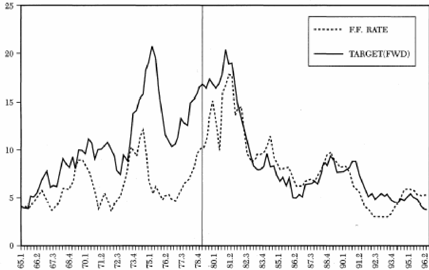
Figure 5. Target Based On Estimated Post-October 79 Rule vs. Actual Funds Rate

1698 Journal of Economic Literature , Vol. XXXVII (December 1999)